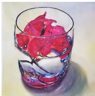
2019 Merit Award Simply Red by Sheila Stilin